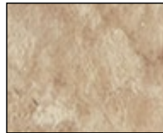
Café claro KR-21